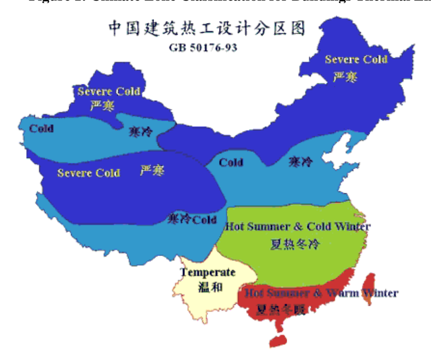
Figure 1: Climate Zone Classification for Buildings Thermal Engineering Design

88. During the selection of demonstration sites, the project preparation team paid special attention to the Sichuan Earthquake disaster areas 15. In order to respond to the Government of China's alleviation and salvage action, Sichuan Province was identified as one of the 9 demonstration candidate provinces. In Dujiangyan County, Sichuan Province, where as one of the most damaged areas by the earthquake, one plant and one village were selected as the demonstration sites. In addition to the criteria applied in identifying other demonstration sites, the identification process particularly considered the feasibility of applying earthquake trash as EE building raw material and the mechanical resiliency of EE buildings against future earthquakes.